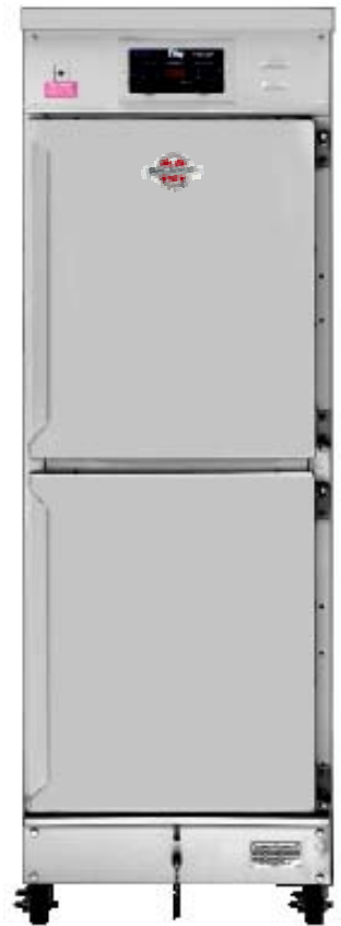
CVAP® HOLDING CABINETS