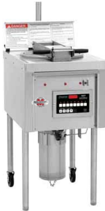
COLLECTRAMATIC® PRESSURE FRYER